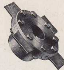
Illustration on the left shows the detachable boss of 18" wheel.

The 16" size is suitable for the Morris Minor, Austin Seven, and Triumph Seven, etc., etc. Reeded pattern grip only.